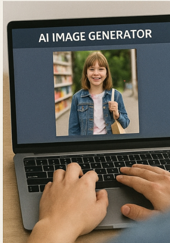
Someone uses AI to make a fake picture of her skipping school.