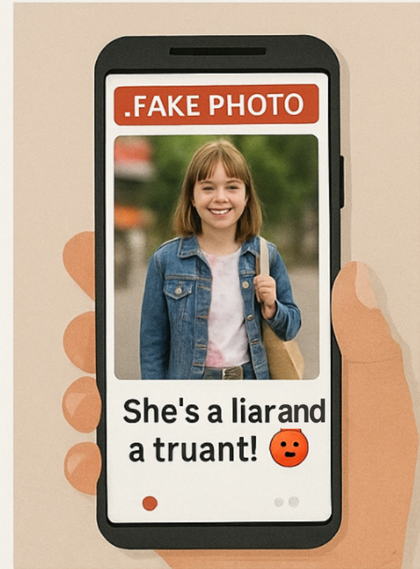
This picture is shared online to be mean and hurtful.