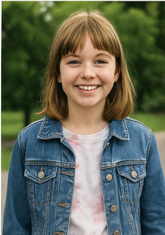
A student takes a photo of her classmate

Is this image created with positive or negative intentions?